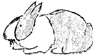
GRAND CHAMPION STOCK

WRITE: SOUTH ERIE RABBITRY (Reg. # 2219)